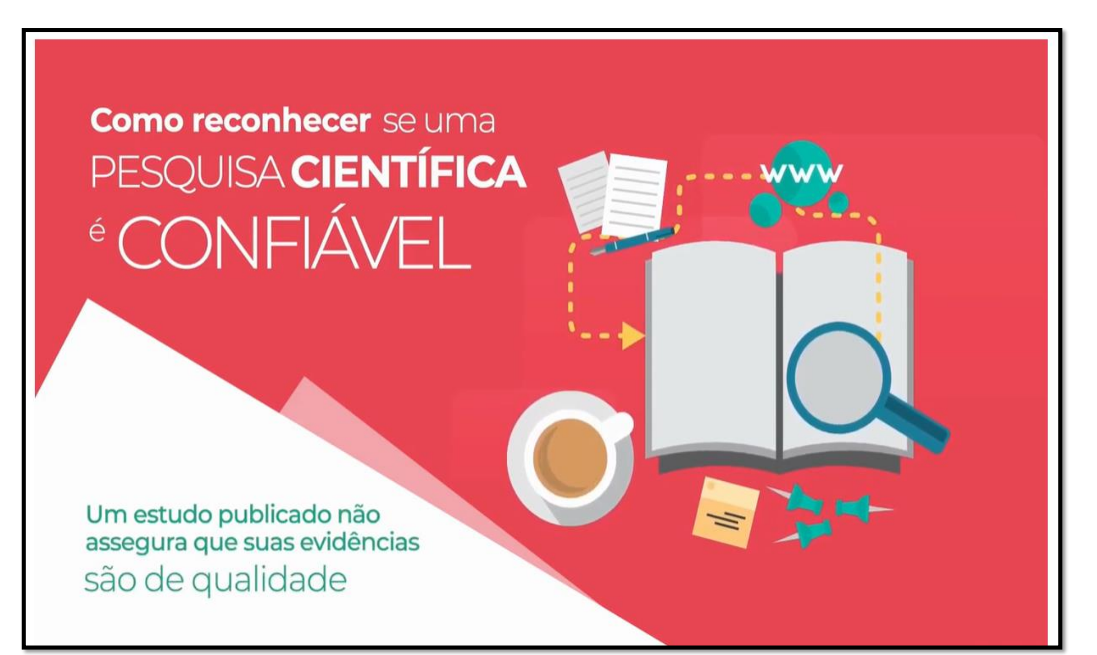
How to recognize if a scientific research is reliable?

Social participation: public health improvements