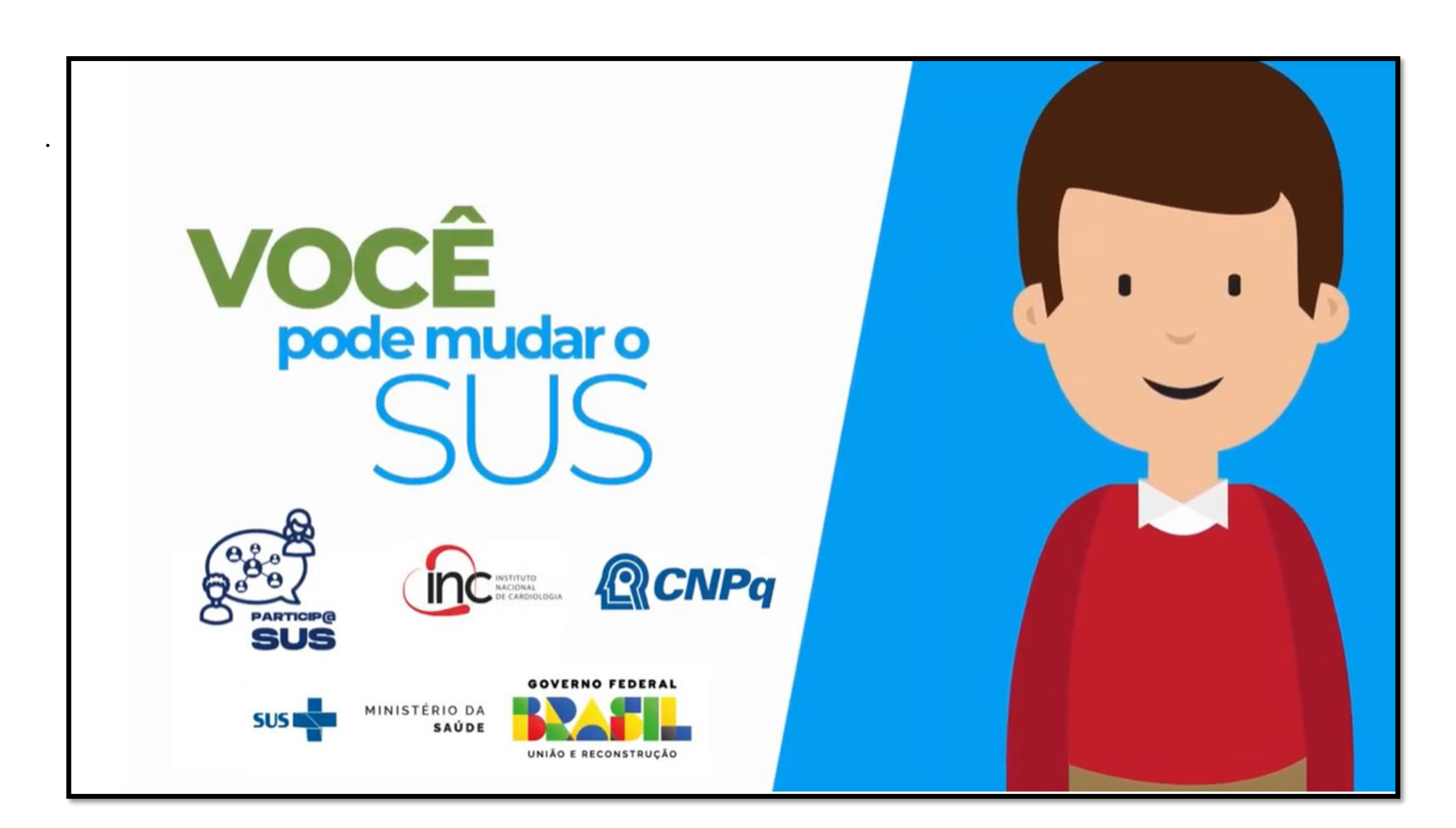
You can change the Unified Health System

• Health training strategies seek to solve users' lack of knowledge about technology incorporation processes in the Brazilian public health system. The user is empowered, and the system is strengthened by health education. It includes social actors in health decisions, privileging the public interest. In a second moment, all videos will be made available on a digital teaching platform to train users with subsequent evaluation through interactive games.